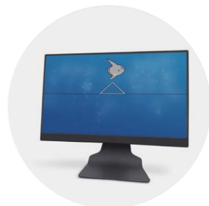
monitor for the client showing the SCP neurofeedback application

Please visit www.neurocaregroup.com for detailed technical specifications.