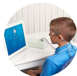
training with SCP neurofeedback