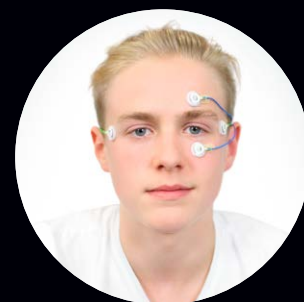
electrodes for the online correction of artifacts during SCP neurofeedback

Scientific and clinical studies conducted in recent years have shown neurofeedback to be effective and specific in the non-pharmaceutical treatment of ADHD. The method shows high effect sizes for the ADHD core symptoms of inattention and impulsiveness and positive – though less significant – effects on hyperactivity. Thus, neurofeedback provides a recognized treatment without side effects to children and adults with ADHD.