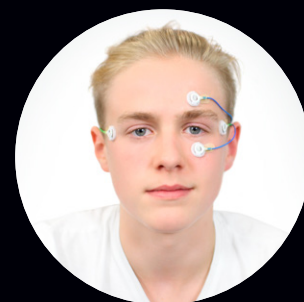
electrodes for the online correction of artifacts during SCP biofeedback

The method is used in the treatment of children aged 7 to 9 with attention-deficit/hyperactivity disorder (ADHD) for reduction of core symptom severity.