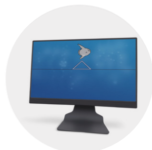
monitor for the patient showing the SCP-Biofeedback application

Please visit www.neurocaregroup.com for detailed technical specifications.