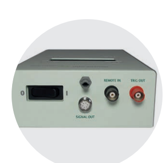
back side with all optional connections