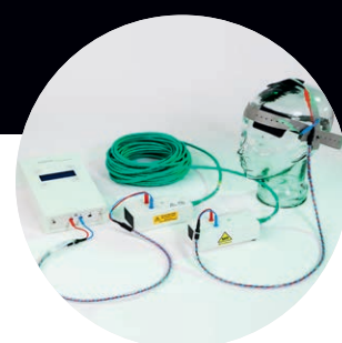
DC-STIMULATOR MR Setup