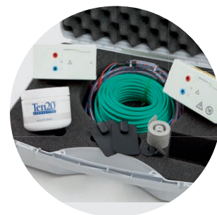
hard cover case for MRI compatible electrodes, cable, „INNER BOX“, „OUTER BOX“