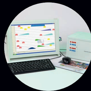
DC-STIMULATOR MC with medical panel PC