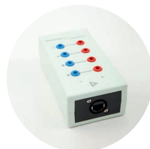
Adaptor box for 4 x 4 / 8 x 8 or 4 x 1 / 8 x 2 stimulations