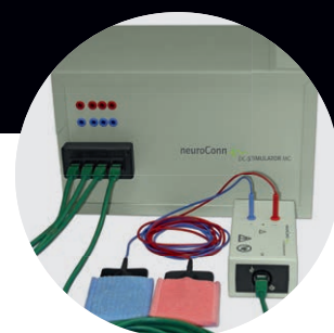
4/8 (optional 16) freely programmable channels