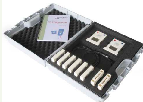
basic set of devices