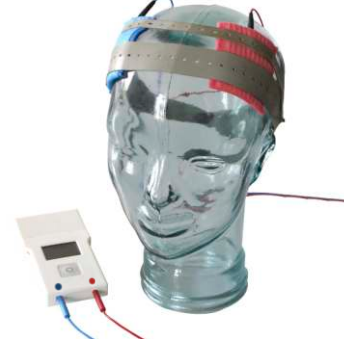
example of use

If you plan to use the DC-STIMULATOR MOBILE in double-blinded studies, please contact the producer for further information.