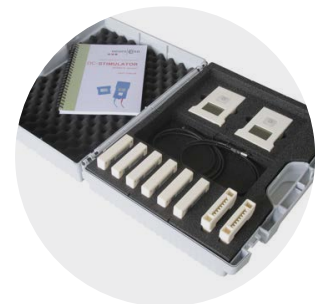
DC-STIMULATOR MOBILE Basic set of devices

tDCS: total stimulation time = fade in + duration + fade out