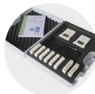
DC-STIMULATOR MOBILE Basic set of devices

tDCS: total stimulation time = fade in + duration + fade out