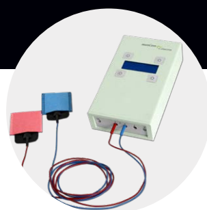
DC-STIMULATOR with rubber electrodes and sponges