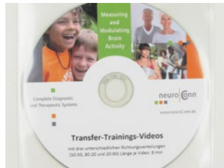
transfer training video, for training at home order # 905570