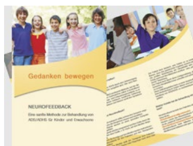
"Neurofeedback" flyer for patient information order # 999910