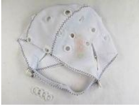
EEG electrode cap TP, 14+4 additional adapters, chin strap

All caps are available in the sizes 52, 54, 56, 58 and 60. Please indicate the size when ordering.