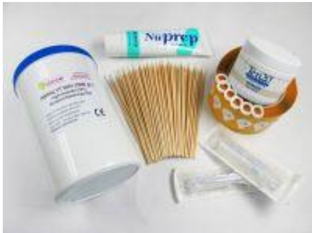
Starter set for EEG caps (ABRALYT HiCl, syringes, cotton buds, adaptors, sticking rings, Ten20, Nuprep)