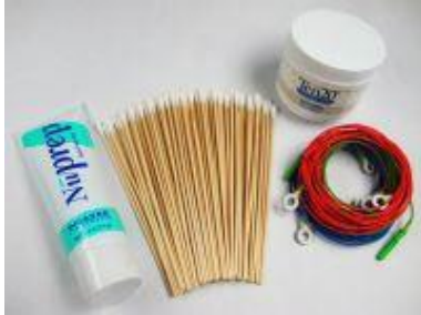
starter set for THERA PRAX ® MOBILE (10 electrodes, Ten20, Nuprep, cotton buds) order # 905510

The following list contains accessories and consumables that are usually used in clinical neurofeedback trainings: