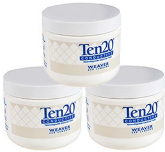
Ten20 electrode paste (228g can), pack of 3 order # 905821