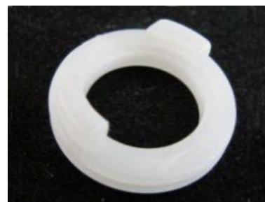
electrode adapter for EEG caps (used with adhesive rings) order # 905200-10