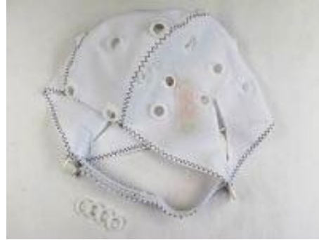
EEG electrode cap TPQ-EEG, 23+4 additional adapters, chin strap