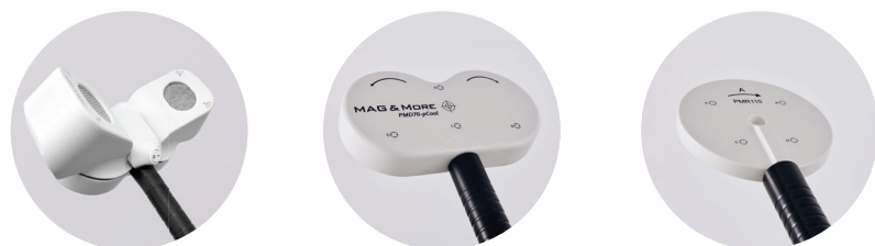
Wide range of coil options including "aCool" (left), "pCool" (center), PMR "round coil" (right)