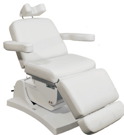
Choice of 'Greiner' Treatment Chair (top) or 'Soleni - Supra Select' Treatment Lounger (above). Available in over 30 colourways