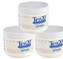
Ten20 electrode paste (114 g can), pack of 3 order # 905820