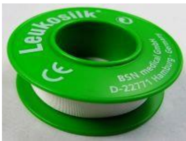
sticking plaster, unsterile), 1 roll of 5 m order # 905940