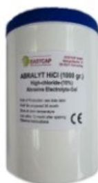
electrode gel ABRALYT HiCl (1,000 g) order # 905810