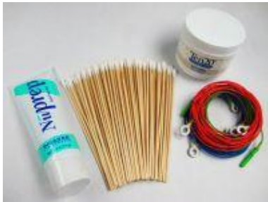
starter set (10 electrodes, Ten20, Nuprep, cotton buds) order # 905510

The following list contains accessories and consumables that are usually used in clinical neurofeedback trainings: