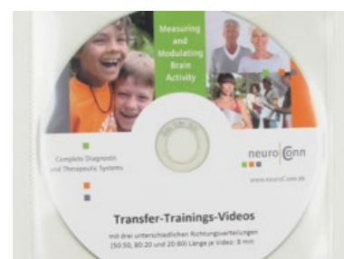
DVD with video for transfer training at home order # 905570