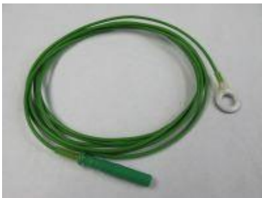
1 sintered Ag/AgCl annular electrode (also suitable for ECG and EMG) order # 905105