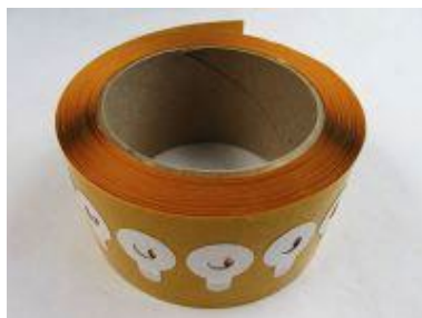
500 adhesive rings for EOG conduction (20x8mm) order # 905910