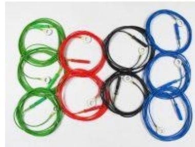
sintered Ag/AgCl annular electrodes (also suitable for ECG and EMG), 10 units