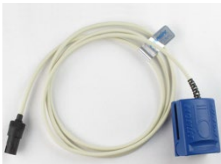
pulse curve sensor finger clip