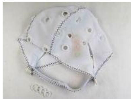
EEG electrode cap TPQ-EEG, 23+4 additional adapters, chin strap