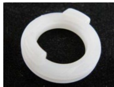
electrode adapter for EEG caps (used with adhesive rings) order # 905200-10