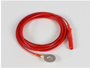
sintered Ag/AgCl annular electrode (also suitable for ECG and EMG), 1 unit