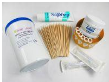
Starter set for EEG caps (ABRALYT HiCl, syringes, cotton buds, adaptors, sticking rings, Ten20, Nuprep)