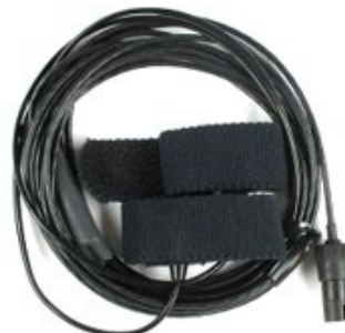
GSR sensor (galvanic skin response)