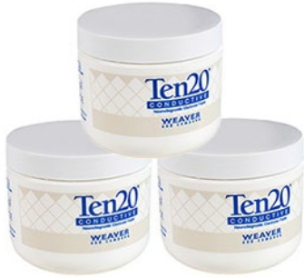
Ten20 electrode paste (228g can), pack of 3 order # 905821