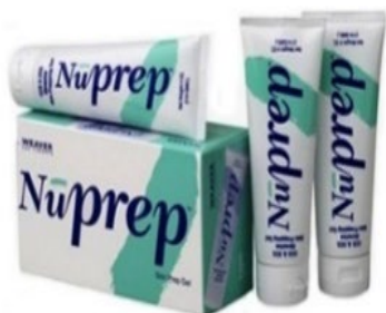
Nuprep abrasive paste (114g), pack of 3 order # 905830