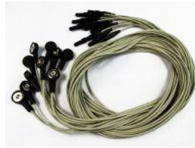
snap cable for disposable EMG/ECG electrodes (150 cm), 10 pieces