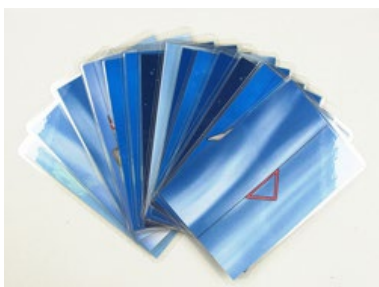
transfer training cards for training at home order # 905550