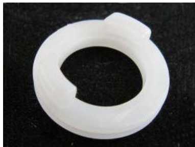
electrode adapter for EEG caps (with 905910 adhesive rings, see consumables)