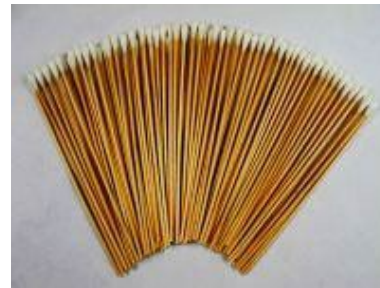
cotton buds, long, unsterile, 100 pieces order # 905920