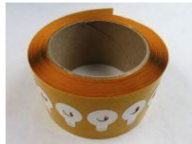
500 adhesive rings for EOG conduction (20x8mm), (with 905200-10 electrode adapter) order # 905910