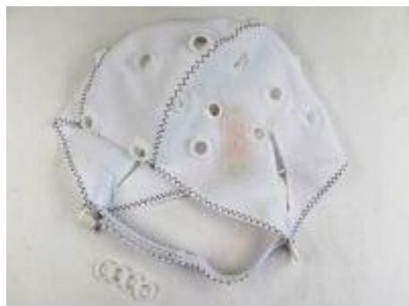
EEG electrode cap TP, 14+4 additional adapters, chin strap

All caps are available in the sizes 52, 54, 56, 58 and 60. Please indicate the size when ordering.