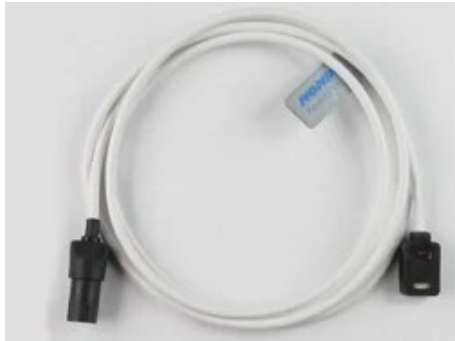
pulse curve sensor reflection sensor