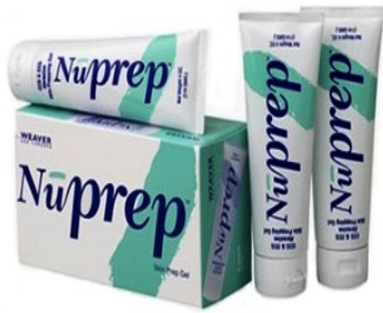
Nuprep abrasive paste (114g), pack of 3 order # 905830