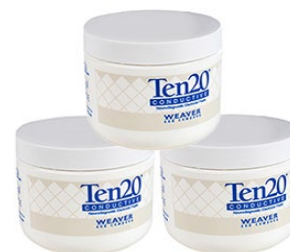
Ten20 electrode paste (114g can), pack of 3 order # 905820