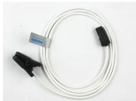
pulse curve sensor ear clip