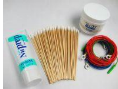
starter set (10 electrodes, Ten20, Nuprep, cotton buds) order # 905515