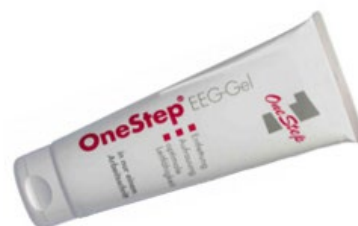
EEG gel OneStep (120 g) order # 905825