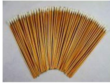
100 cotton buds, long, non-sterile order # 905920