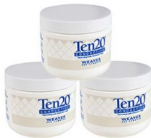
Ten20 electrode paste (228g can), pack of 3 order # 905821